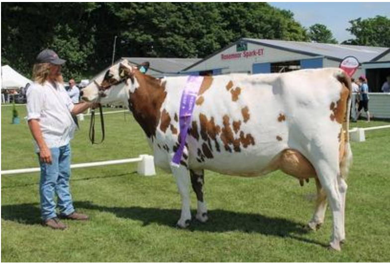
PHOTO: Brookview Dist Spirito, Brookview Genetics, Tokoroa – North Island Senior Champion, Cow 7 yrs & older